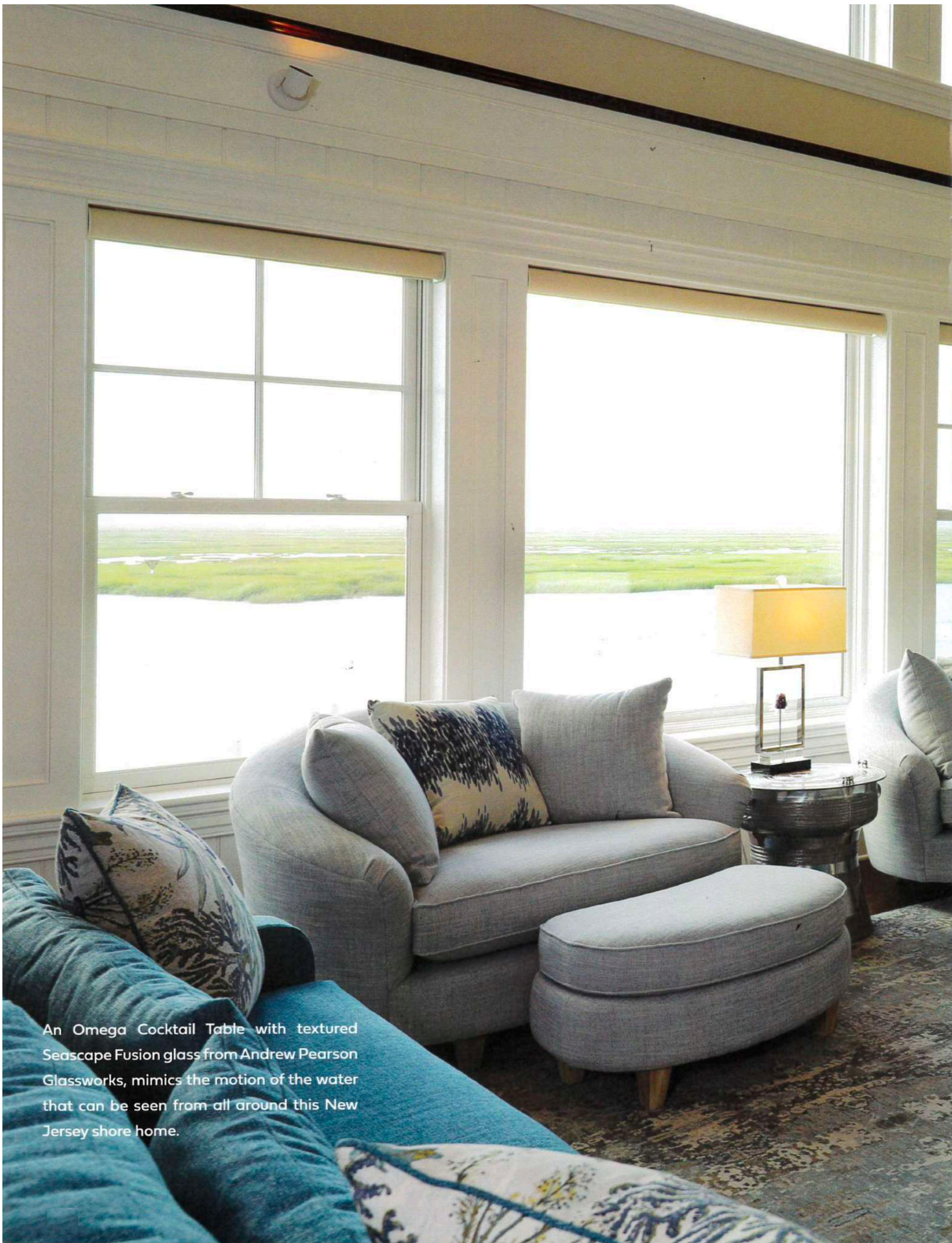
An Omega Cocktail Table with textured Seascape Fusion glass from Andrew Pearson Glassworks, mimics the motion of the water that can be seen from all around this New Jersey shore home.